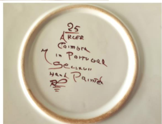
Pot diameter (top) 25 cm