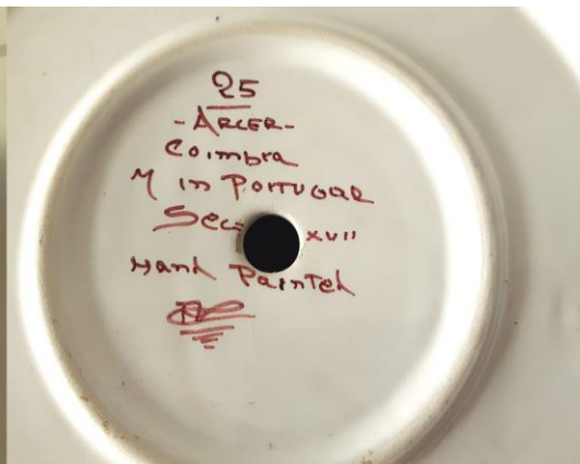
Far left: The Pot